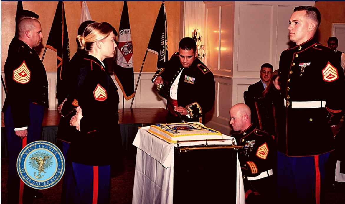
photo from our 2018 USMC birthday ceremony

ESTABLISHED NOVEMBER 10, 1775 | PHILADELPHIA, PA